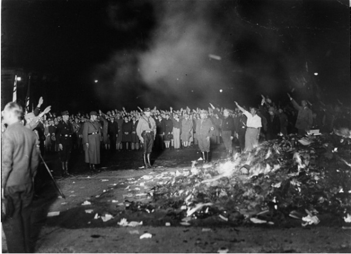
The public burning of 'un-German' books by members of the SA and university students on the Opernplatz in Berlin, 1933